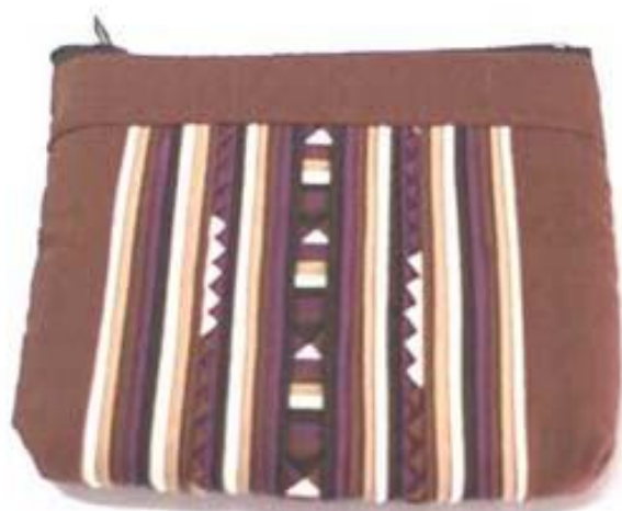
Lisu Small Purse/11.5x9.5cm-Brown

Code : 05-24-017-07 Size : 11.5x9.5 cm. Weight : 30 gm. Materials 65 % Polyester 35 % Cotton FOB Price ฿45.00 Thai Baht. 1.55 USD.