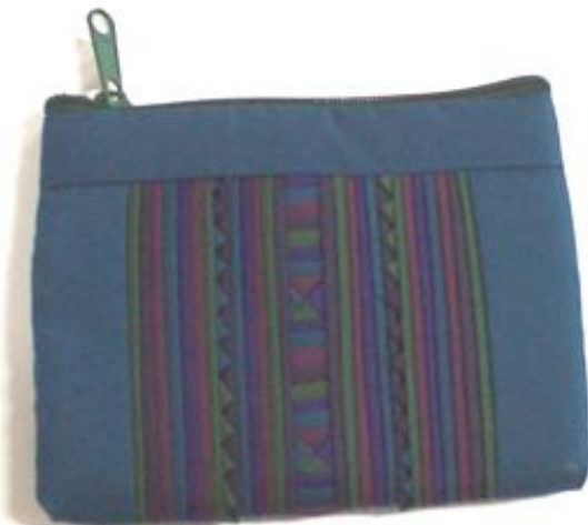
Lisu Small Purse/11.5x9.5cm-Jade Green

Code : 05-24-002-21 Size : 11.5x10 cm. Weight : 30 gm. Materials 65% Polyester 35% Cotton FOB Price ฿45.00 Thai Baht. 1.55 USD.