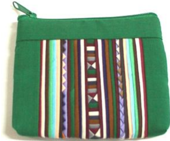
Lisu Small Purse/11.5x9.5cm-Green

Code : 05-24-002-04 Size : 11.5x10 cm. Weight : 30 gm. Materials 65% Polyester 35% Cotton FOB Price ฿45.00 Thai Baht. 1.55 USD.