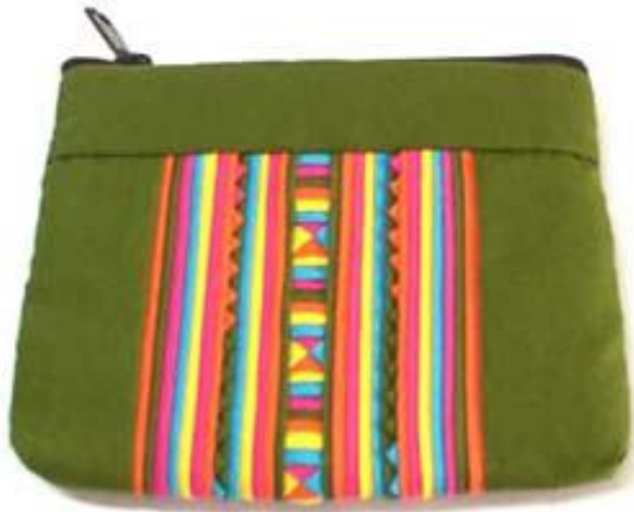
Lisu Small Purse/11.5x9.5cm-Moss Green

Code : 05-24-017-14 Size : 11.5x9.5 cm. Weight : 30 gm. Materials 65 % Polyester 35 % Cotton FOB Price ฿45.00 Thai Baht. 1.55 USD.