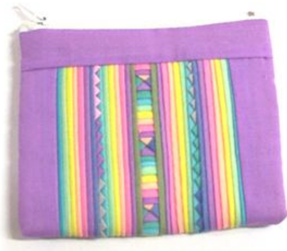
Lisu Small Purse/11.5x9.5cm-Purple

Code : 05-24-002-08 Size : 11.5x10 cm. Weight : 30 gm. Materials 65% Polyester 35% Cotton FOB Price ฿45.00 Thai Baht. 1.55 USD.