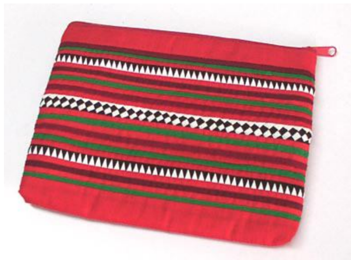
Lahu Purse with Strap/16x14cm-Gray

Code : 04-24-026-15 Size : 16x14 cm. Weight : 30 gm. Materials 65% Polyester 35% Cotton FOB Price ฿84.00 Thai Baht. 2.90 USD.