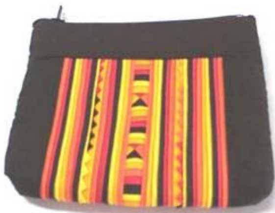
Lisu Small Purse/11.5x9.5cm-Black

Code : 05-24-017-01 Size : 11.5x9.5 cm. Weight : 30 gm. Materials 65 % Polyester 35 % Cotton FOB Price ฿45.00 Thai Baht. 1.55 USD.