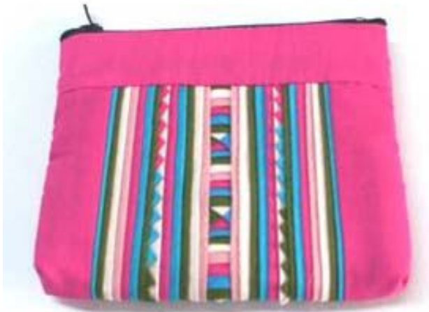
Lisu Small Purse/11.5x9.5cm-Hot Pink

Code : 05-24-017-26 Size : 11.5x9.5 cm. Weight : 30 gm. Materials 65 % Polyester 35 % Cotton FOB Price ฿45.00 Thai Baht. 1.55 USD.