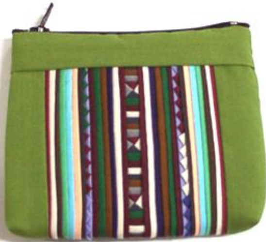
Lisu Small Purse/11.5x9.5cm-Moss Green

Code : 05-24-002-14 Size : 11.5x10 cm. Weight : 30 gm. Materials 65% Polyester 35% Cotton FOB Price ฿45.00 Thai Baht. 1.55 USD.