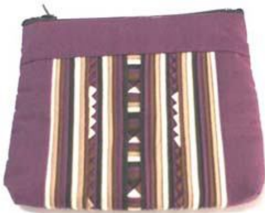
Lisu Small Purse/11.5x9.5cm-Mangosteen

Code : 05-24-017-30 Size : 11.5x9.5 cm. Weight : 30 gm. Materials 65 % Polyester 35 % Cotton FOB Price ฿45.00 Thai Baht. 1.55 USD.