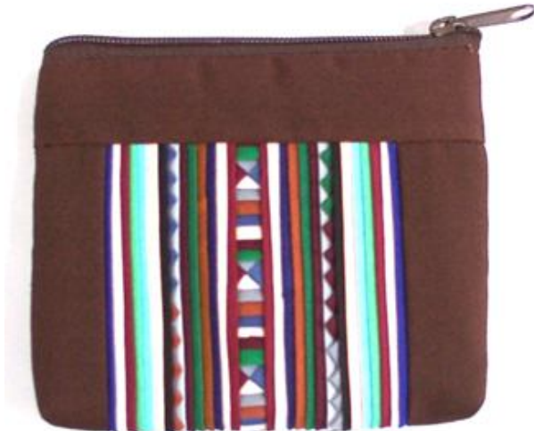
Lisu Small Purse/11.5x9.5cm-Brown

Code : 05-24-002-07 Size : 11.5x10 cm. Weight : 30 gm. Materials 65% Polyester 35% Cotton FOB Price ฿45.00 Thai Baht. 1.55 USD.