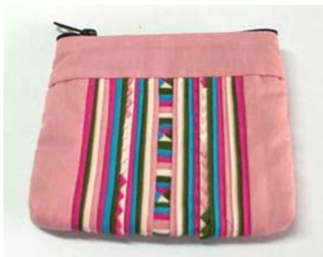
Lisu Small Purse/11.5x9.5cm-Pink

Code : 05-24-017-13 Size : 11.5x9.5 cm. Weight : 30 gm. Materials 65 % Polyester 35 % Cotton FOB Price ฿44.00 Thai Baht. 1.52 USD.